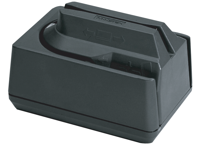
Mini MICR with MSR