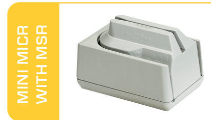
MINI MICR WITH MSR